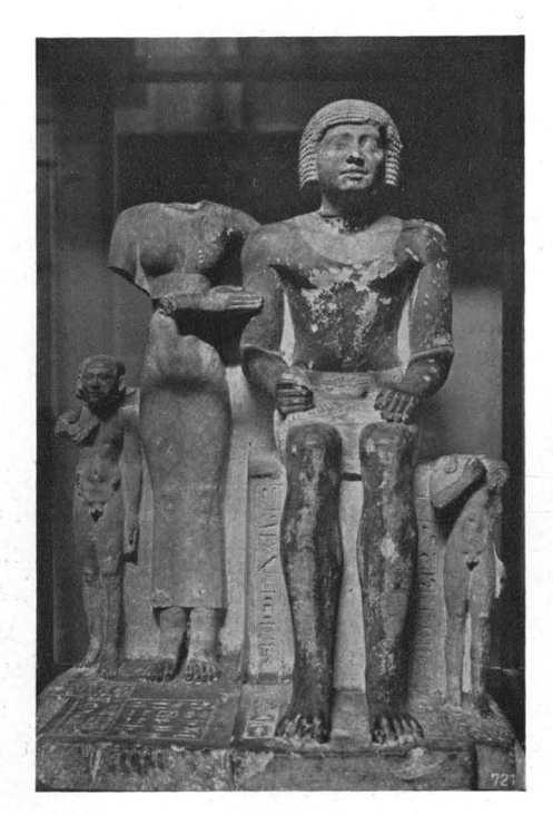
FIG. 2 FAMILY GROUP, CAIRO

Egyptian sculpture was practical in its aim in that figures of this type were not made for public exhibition but were intended for the tomb in order that they might be of direct advantage to the deceased in the life hereafter. The tomb or mastaba was a massive oblong of masonry containing three separate and essential elements: a vertical pit ending below in the funeral chamber where the mummy was kept, and a walled chamber, the serdab, where the images or statues of the deceased are preserved until they are visited by the Soul (Ba). Both of these rooms were walled up after burial and the only accessible compartment within the tomb was the chapel, the third element, which was open to kinsfolk, friends and the priests who paid worship and offerings. To enable the soul of the deceased to recognize and "enter" the image and thus prolong its future life it was imperative that the sculptor create as living a statue as possible of his subject, who is always represented in the bloom of youth. To heighten the effect of realism the sculpture was invaria-