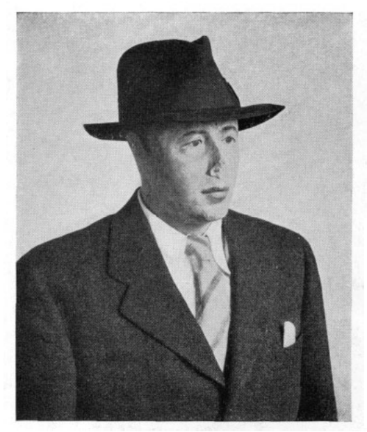
Ankh-haf in Modern Dress