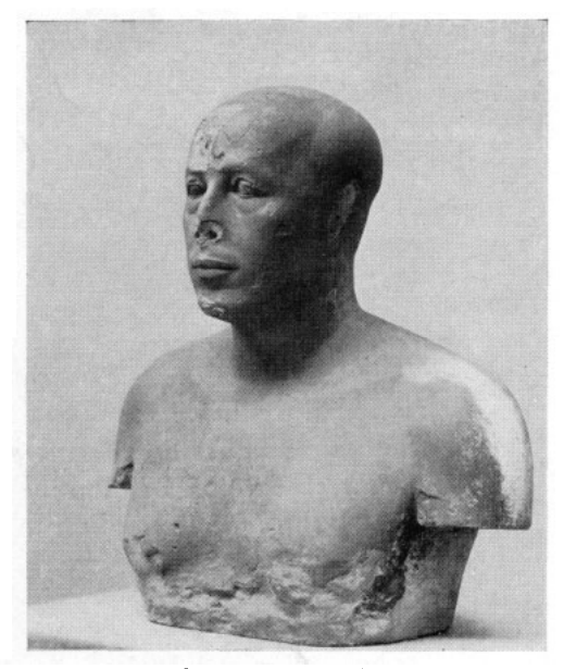
Original Limestone Bust of Ankh-haf

The portrait bust of Prince Ankh-haf of the Fourth Dynasty (No. 27.442), perhaps the most realistic Egyptian portrait preserved, is the work of one of the great masters of the Old Kingdom, and is totally lacking in the conventionality so common in works of Egyptian portraiture. One of the greatest treasures of the Egyptian Department, this bust was evacuated out of the Museum nearly a year ago as a precaution against possible damage by enemy action. Before being sent away a cast was made from the original for temporary exhibition for the duration of the war. An imperfect duplicate cast was tinted in flesh tones, and the eyes, eyebrows, and hair were colored in an approximation to lifelike values. This cast was then fitted with modern clothing in a somewhat jocular effort to satisfy the writer's curiosity as to what an ancient Egyptian nobleman would look like if living today in our own familiar world. The result was so striking that it has seemed justifiable to publish a photograph, which is here given for comparison with one of the original head.