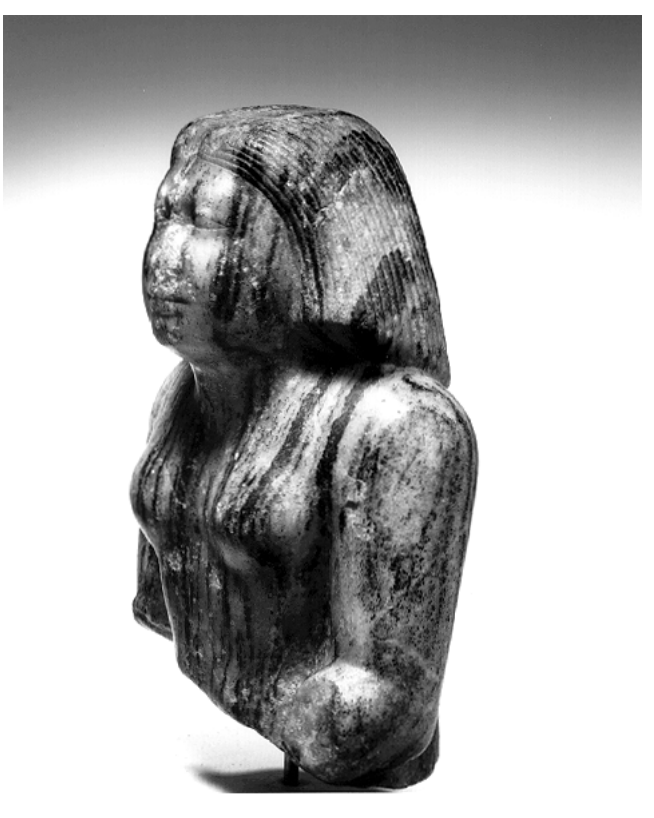
Fig. 5. Old Kingdom bust of a woman, right 3/4 view.