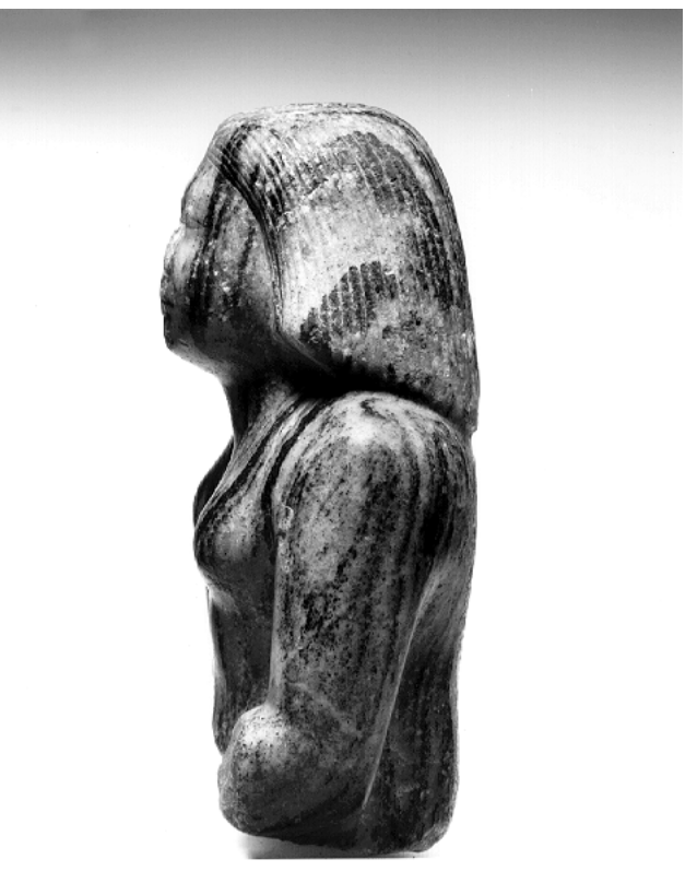
Fig. 3. Old Kingdom bust of a woman, right profile.