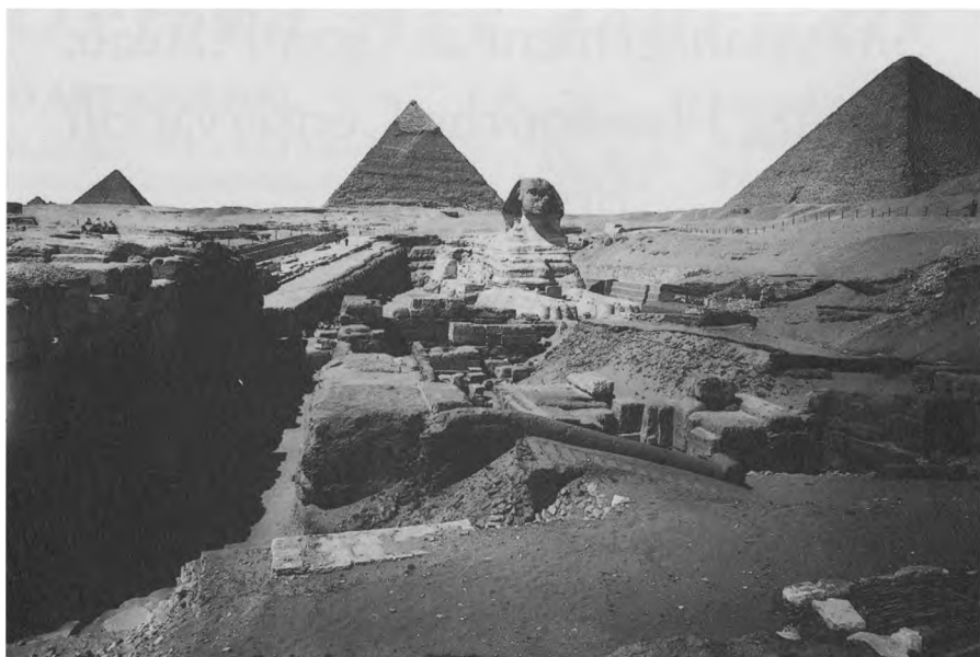
FIGURE 1. THE SITE OF THE GIZA PLATEAU IN 1936. THE THREE PYRAMIDS OF KHUFU, KHAFRE, AND MENKAURE. THE SPHINX IS LOCATED FARTHER DOWN THE PLATEAU.

the main pyramid. One was discovered only recently at the southeast corner of Khufu's Great Pyramid. 2