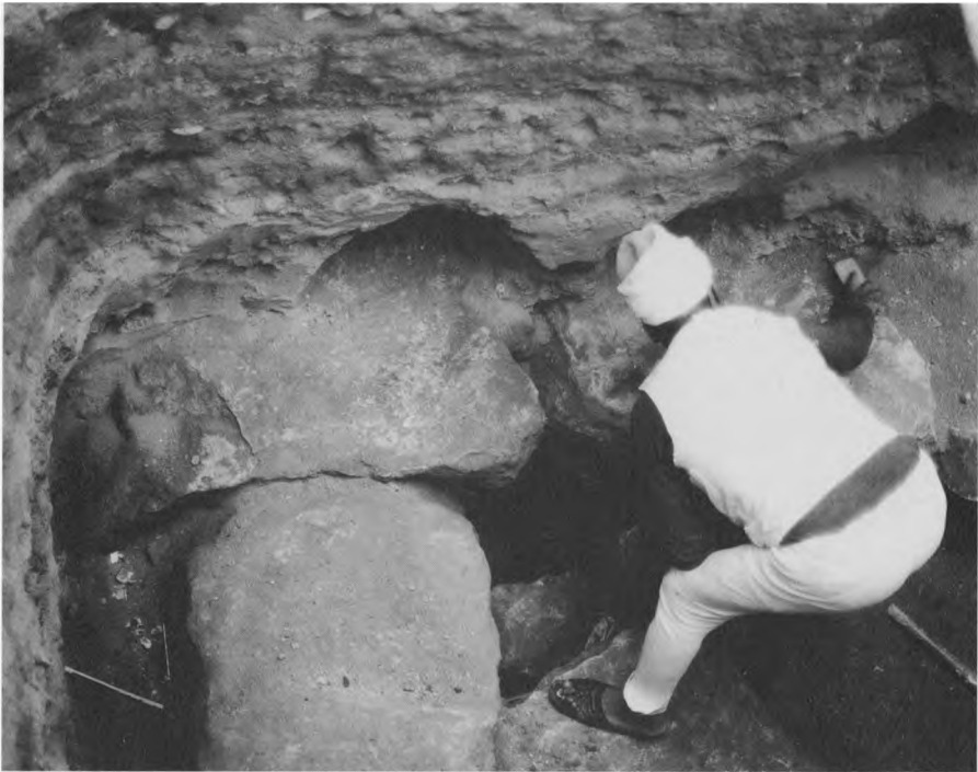
FIGURE 3. THE CONSTRUCTION OF THE SEWAGE SYSTEM OF THE VILLAGE OF NAZLET EL-SAMMAN. BLOCKS FROM THE CAUSEWAY OF KHUFU'S PYRAMID WERE DISCOVERED NEARBY.

revenues for the country's economy and also for the preservation of the monuments. The management plan includes special arrangements for site visits, such as opening the Great Pyramid after hours for meditation by members of metaphysical groups.