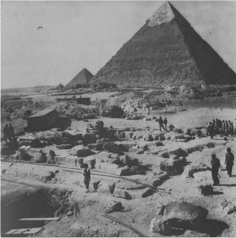
FIGURE 10. THE RESTORATION AND CLEANING OF THE EAST SIDE OF THE GREAT PYRAMID. REMAINS OF A NEW PYRAMID WERE DISCOVERED NEARBY.

The same work will be conducted in the cemetery south of the Great Pyramid and also on the causeway of Khafre. The western cemetery field is a major site and needs the same procedures as the eastern field. These sites have already been excavated by a number of scholars, 27 but many areas between the tombs have remained intact and unexcavated, so careful archaeological research needs to be done. 28 Therefore, each site needs a fully equipped conservation lab operated by well-trained personnel.