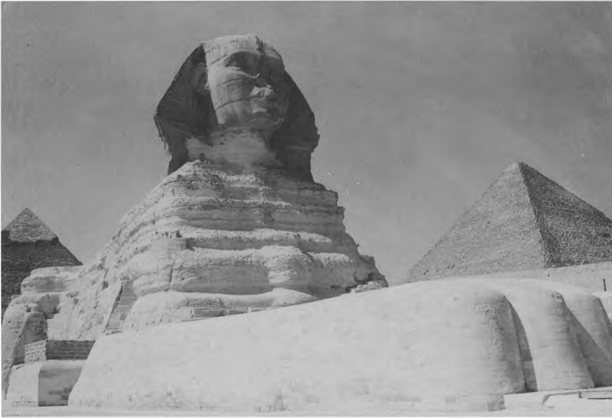
FIGURE 6. THE SPHINX IN 1998.