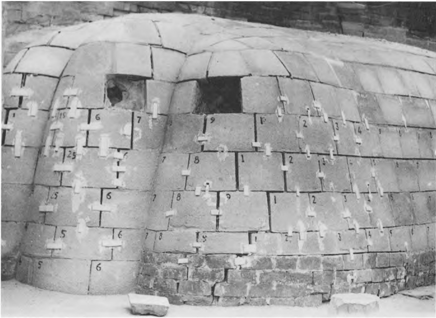
FIGURE 4. THE RESTORATION OF THE SPHINX (1982–87). LARGE STONES AND CEMENT WERE USED.