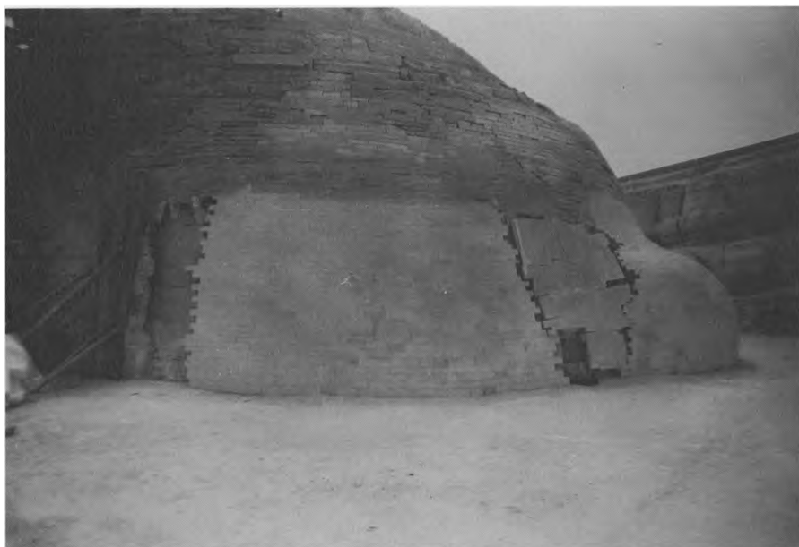
FIGURE 5. RESTORATION OF THE TAIL IN 1993.

chitectural conservation. On the other hand, some important conservation work using scientifically correct techniques, including thorough preliminary documentation, has been successfully undertaken for the three pyramids at Giza. Another plan has outlined conservation for the tombs in the eastern field, those of the western field of Khufu's pyramid, and those lining the causeway of Khafre. This conservation plan owes its success to the cooperation among archaeologists, architects, and conservators. 18