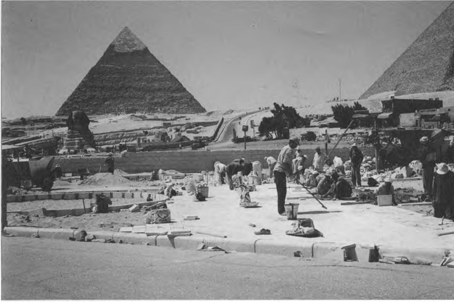
FIGURE 9. THE PLAN OF THE SPHINX SQUARE.

el-Samman from the Sphinx. The wall was built high enough to block the view of modern houses, which are not in keeping with the dignity of the ancient site. Furthermore, the wall includes tourist facilities such as toilets, a first-aid station, and offices for the tourist police and antiquities officials. At the same time, we prohibited cars from parking in front of the Sphinx and established a new parking lot away from the site. It is important to note that architects cannot work alone in site planning; cooperation between archaeologists and architects is needed. Nevertheless, archaeologists should be in control of site management, and architects should carry out their plans.