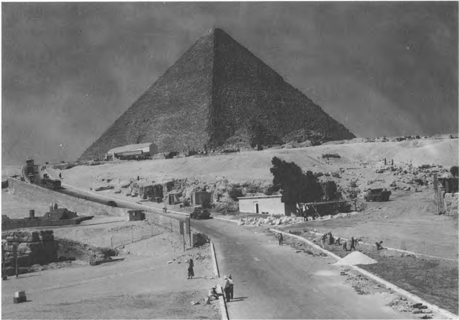
FIGURE 2. THE MODERN BOAT MUSEUM NEAR THE GREAT PYRAMID.

Along Pyramids Road, houses were built on the left as one drives toward the pyramids. The buildings reach about ten stories high, blocking the view of the monuments. No longer can the pyramids be seen from Giza Square or the Mo-handissiin area. Now the pyramids are almost downtown.