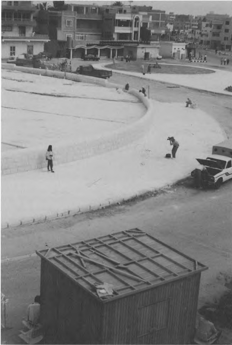
FIGURE 8. THE PLAN OF THE SPHINX SQUARE.

to such archaeological features such as the queens' pyramids, the boat pits, the trial passage, and the Hetep-heres shaft.