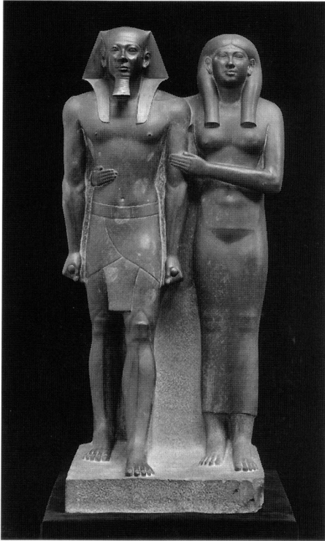
Pl. 23, 1: Pair statue of King Mycerinus and Queen. MFA 11.1738. Giza. Harvard University/Museum of Fine Arts Expedition.