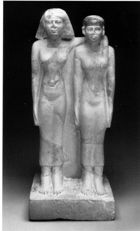
Pl. 23, 2: Pair statue of Hetepheres and Mersyankh. MFA 30.1456. Giza. Harvard University/Museum of Fine Arts Expedition.